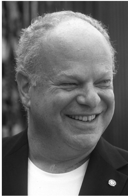
Martin E. P. Seligman